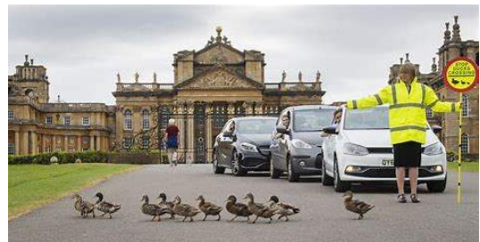
Watch out for ducks and geese families crossing the roads now.