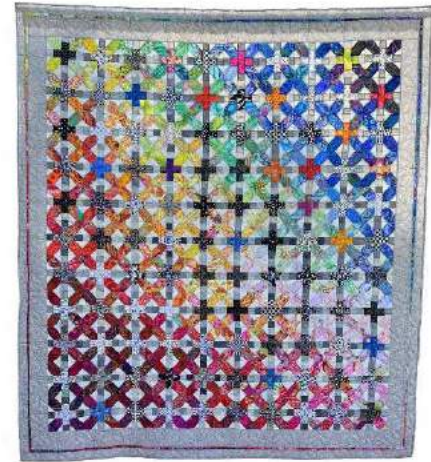
Color Me Happy Raffle Quilt 2024 Quilt Size 83" x 90"

Rhapsody of Color Quilt Show 2024 May 2nd, 3rd, and 4th First Presbyterian Church of Howard County 9325 Presbyterian Circle Columbia, MD